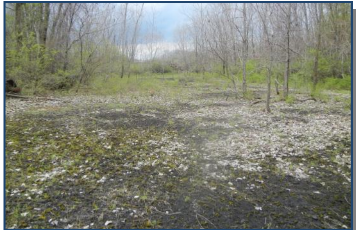
Currently, the site does not support high quality riparian habitat.

The City of Lorain received a $175,000 grant from the National Oceanic and Atmospheric Administration through the Great Lakes Restoration Initiative in 2014 to assess future riparian restoration. The project funded assessment of approximately 6 acres encompassing a berm and former sludge lagoon near the existing heron rookery along the Lower Black River. Soil borings were taken and a topographical survey was performed. Information from these investigations was used to create a cost estimate for several alternative restoration methods. All of the proposed alternatives will involve the restoration of a 6-acre portion of riparian habitat populated by native plant species.